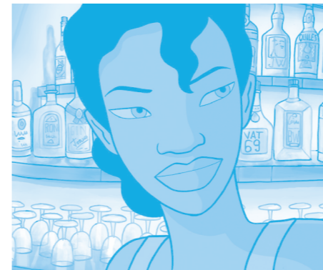
Chico & Rita (Spain / United Kingdom, 2010)

The first open-air screening of this year's Anifilm is dedicated to Cuban colours and rhythms. Right after dark, we will screen the Spanish-British feature film Chico & Rita at the Masaryk Square. Visually attractive and packed with emotions, the story of a jazz musician and his beloved singer will take the viewers to Cuba in the 1940s and gradually move to the United States and Europe.