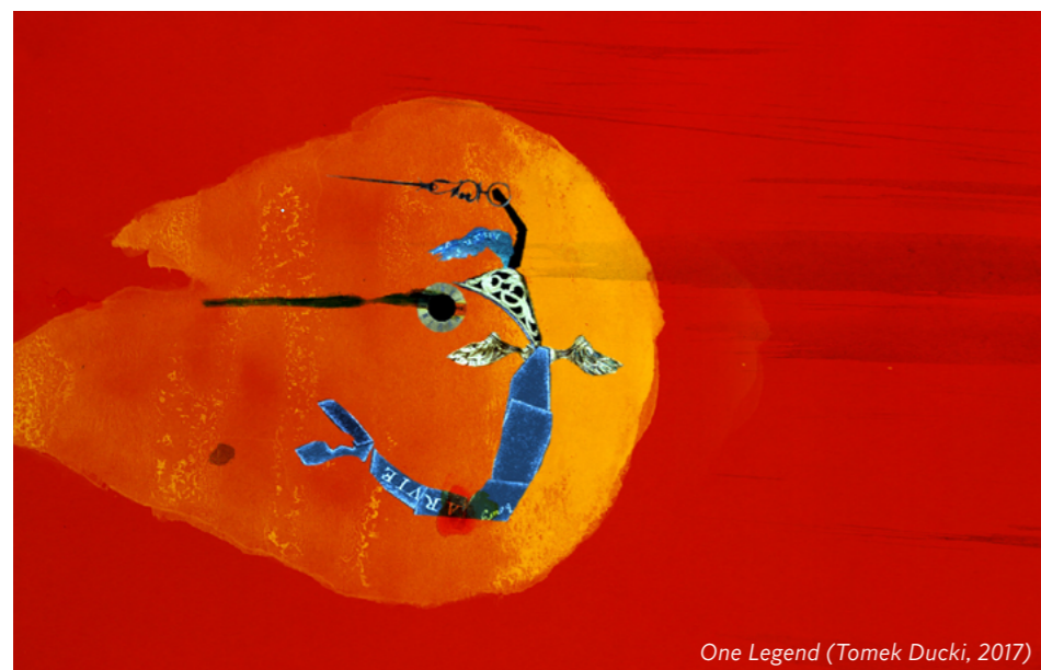
One Legend (Tomek Ducki, 2017)